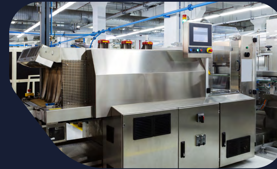
Heavy & industrial machinery

We provide logistics solutions for several industries, minimizing downtime in manufacturing, oil and gas, chemical and pharmaceutical, mining, railway, automotive, healthcare, food processing, and construction, among others.