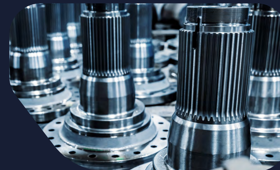
Spare parts inventory